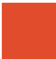
PANTONE PQ-17-1463TCX Tangerine Tango

Tangerine Tango is an orange-red hue, perfect for brightening up darker spaces or adding a fiery pop of color. Whether you draw inspiration from the changing leaves—or rich Spring sunsets, orange is defiantly an undeniably cozy and earthy reference for a chic Midcentury decor.